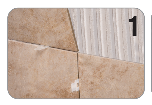
Slide two clips under the tile and into the mortar approximately 2" from each end of the tile. Place the second tile.