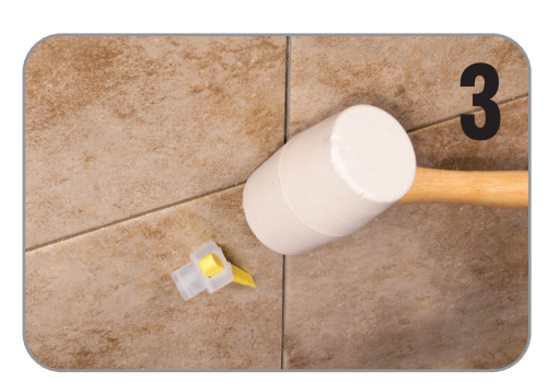
Once mortar has set, simply tap the clips with a non-marring rubber mallet to snap off at the specially designated break-points. Save wedges for future use.

The LASH system should only be used with a minimum 1/4" x 3/8" x 1/4" square trowel notch to apply the setting material. Back buttering your tile is always recommended.