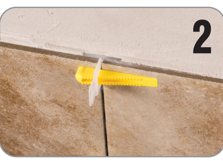
Slide the reusable wedges into the clips to LEVEL, ALIGN, SPACE and HOLD the tiles.